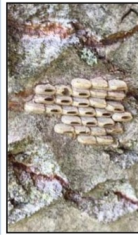
The empty remains of the eggs that have hatched can be found at any time of the year.