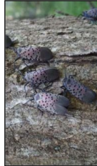
The adults (shown at rest) can be present from July until late December. The adults are 1 to 1 1/4 inches long.