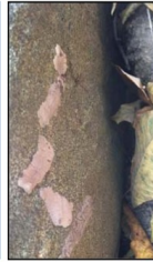
The egg masses can be on trees, rocks, or any other solid object and can be present from September through May.