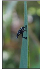
The young nymphs are black with white spots and can be present from May until October.