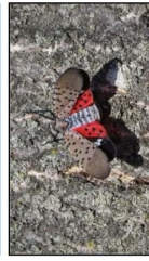
An adult showing the red underwings when disturbed