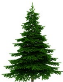
LIVE CHRISTMAS TREES

Recycle your Christmas tree at the Penn Township Municipal Building. Trees can be dropped off behind the office within the orange safety fence until January 29th.