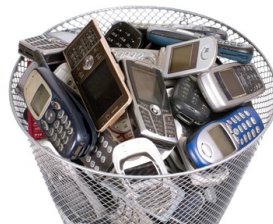
CELLPHONES & TABLETS

All stands, lights, decorations, and tinsel must be removed. Artificial trees cannot be recycled.